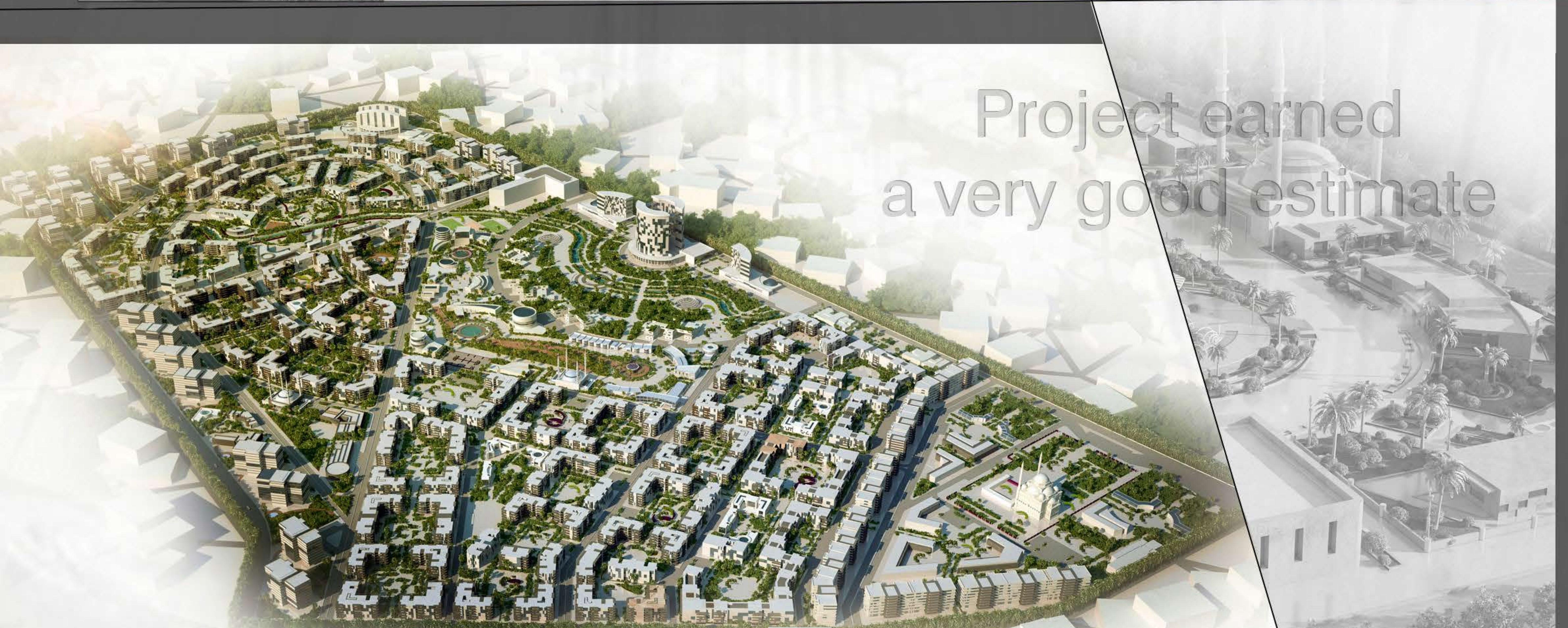
Graduation Project to renovate Al-Khaldia district in City of Homs