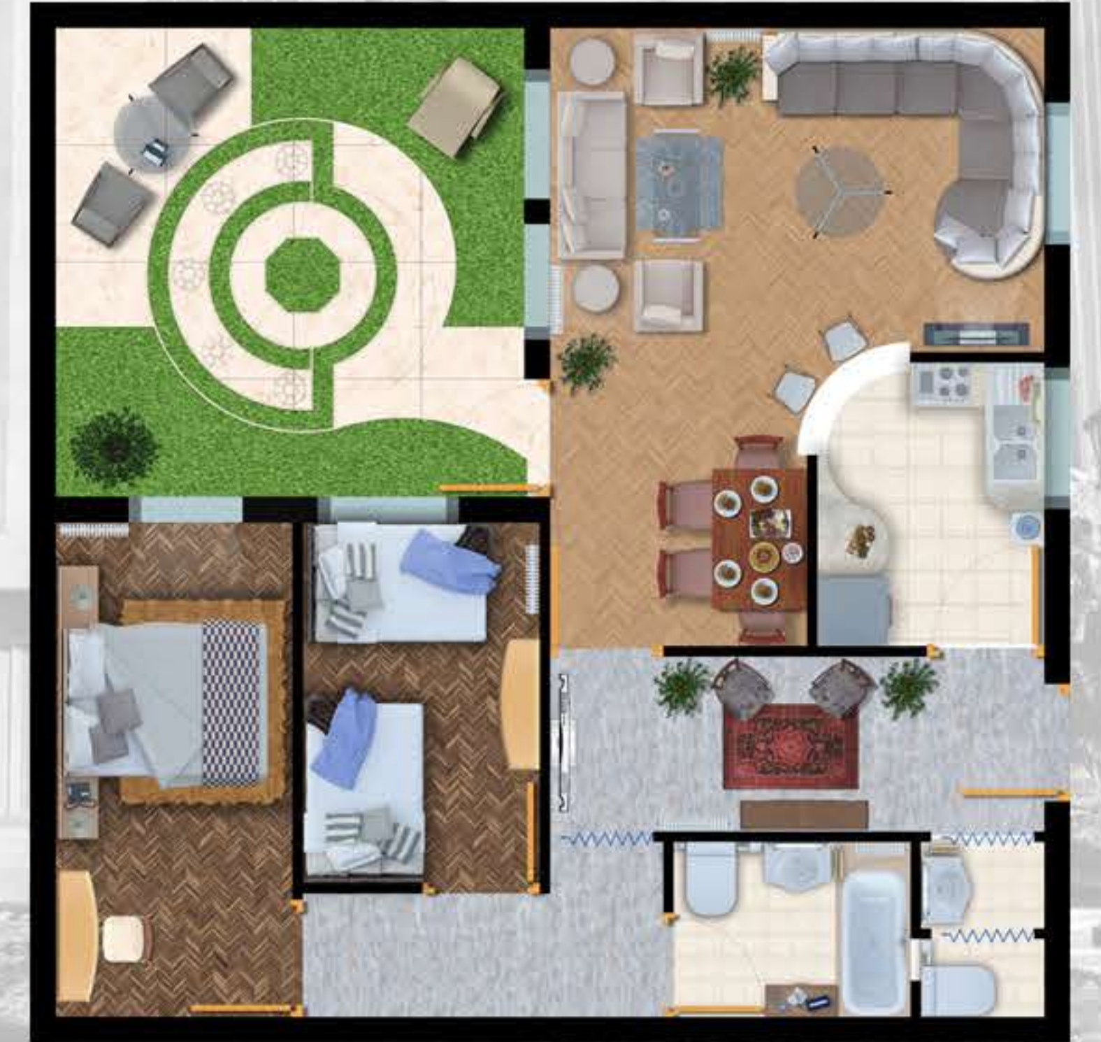
layout plan of unit housing