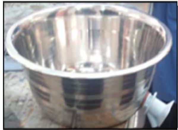
Fig. 5, the central container of the system

ing the produced water to protect the the distilled water from mixing with any pollutants, bacteria, or germs.