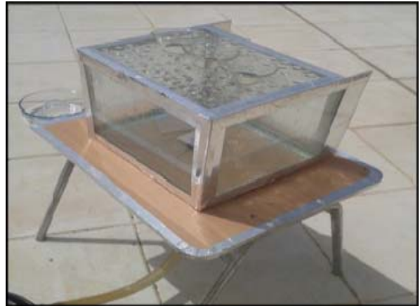
Fig.1, the filtration part