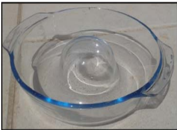
Fig. 4, the condensing unit