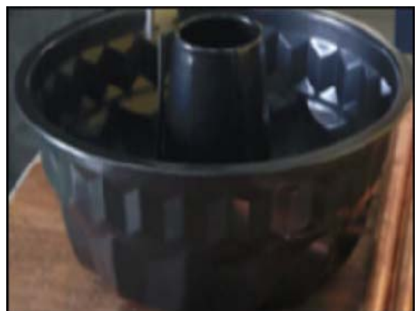
Fig. 2, the steel container (evaporation part)