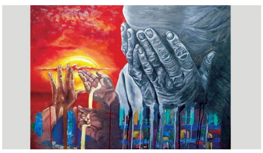
Figure 2. Jassim Al-Bayati. "The loss of a loved one" (2020) https://aawsat.com/home/article/2345791/

Another idea expresses the various states of the virus, including the painting of the Iraqi artist Jassim Al-Bayati. Al-Bayati's painting represents the extent of the psychological state that people went through on the one hand. On the other hand, it presents the houses that became empty after the epidemic destroyed the people who lived there. Also, this painting represents people crying over the loss of a loved one while other people's hands appear as they try to stay alive while pointing to the sun (figure 2).