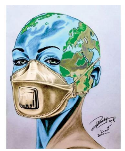
Figure 3. Yassine Ahmadi. "The globe" (2020) https://aawsat.com/home/article/2345791/

Through this painting (Figure 3), the researcher notes that the artist personified the outbreak of the epidemic worldwide in an artistic way that expresses the world's unity towards this disease. The artist painted the mask on the girl's face, indicating the need to wear the protective cover in a very artistic method (Ryan, 2010). The artist Fahd Al-Maadeed (2020) emphasized the importance of interaction with events and crises. Because art is a message and a means for self-expression and what is going on around us, saying that art is a message and the language of the world for a change. The artistic works significantly contribute to society's awareness of the need to follow preventive measures to preserve their health, noting that this crisis is an opportunity for the artist to think and be alone with oneself to present his best in this art."