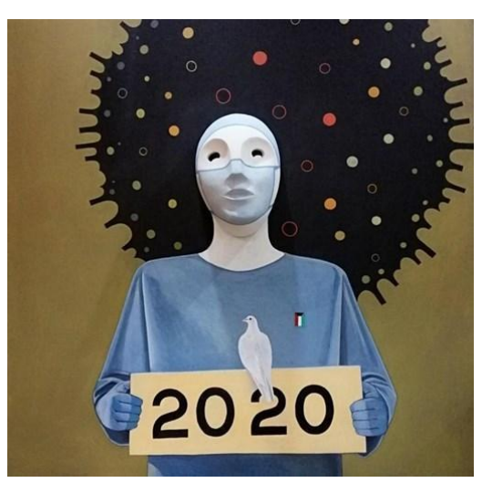
Figure 5. Anber led. "Let the history records" (2020) https://kuwaitpress.net/show111974.html

No artist has captured the impact of medical staff's role in their response to the Covid 19 epidemic, such as in the painting by the Kawiti artist Anber led. This painting shows a bright side and a glimmer of hope in major humanitarian crises, such as epidemics (Kathleen K. Desmond, 2011). Moreover, this painting attempts to alleviate the situation by elucidating the elements of joy and hope that catalyze the continuation of resistance and attachment to life (Figure 5).