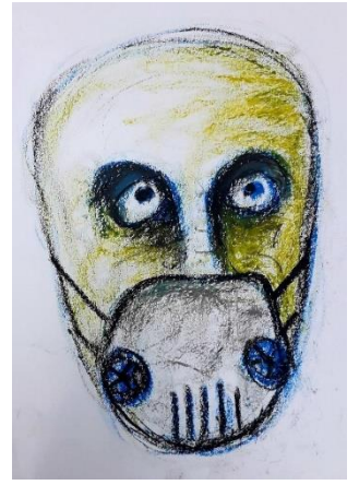
Figure 4. Adel Al-Foutieh. "The eyes" (2020) https://www.independentarabia.com/node/109631/

In addition, the ideas that express the state of the virus Corona (Covid 19) include in the painting of Libyan artist Adel Al-Foutieh. The artist focused on his artwork on the face, where the eyes appear in his artistic painting wandering, while the medical muzzle covers most of the face (Kalita, 2019). The painting shows the extent of panic and fear that appear in the shape of the face and is reflected in the artist's treatment of the eyes in particular, while the signs and rapid lines impose a tense effect on the whole composition (Goodell & Huynh, 2020). These artistic elements, represented by the line-drawing movement, are linked to the epidemic that has significantly invaded the work of Arab artists, such as the wearing of masks (figure 4).