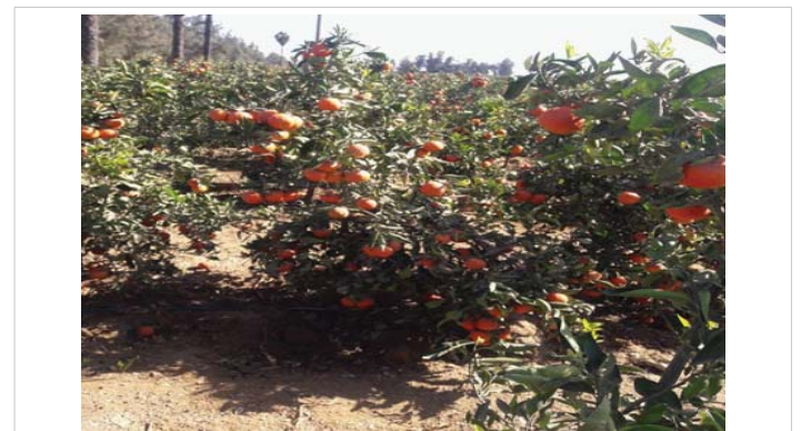
Figure 1: Mandarin orchards in Egypt.

Furthermore, reducing space between and within trees rows has become essential to improve conversion biomass