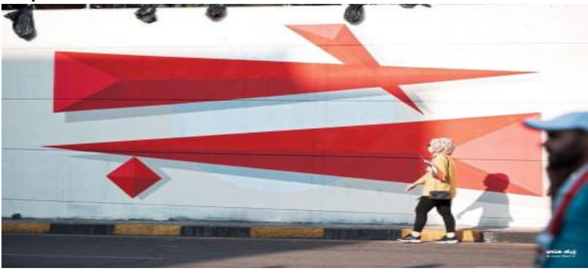
Sample 3. 'Love' in Cuneiform.

The painter or painters emphasize their respect for their identity and self through what their generation has, and their nickname has been transformed from a derogatory nickname to a nickname of courage for different connotations. As for painting (b) the same concept and in three levels, the farthest level of the tuktok and part of the flag of Iraq, which embraces the Turkish restaurant or the so-called Mount One on the second level and the flag of Iraq shows the symbols of the sculptures of the Freedom Monument of Jawad Salim, interspersed with the martyr militant Ibn Thanwa Safaa Al-Saray at the first level and the closest to the viewer.