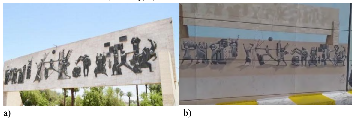
The Liberation Monument: a) Jawad Saleem, b) revolution artists