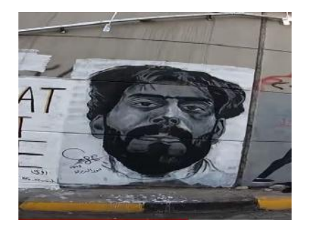
Sample 1: Safaa Al-Saray (ibn Thanwa)

A white shirt and an eye staring at the horizon for the most beautiful time will come, in the midst of the painters' search for the topics of the revolution, which represent them showing the icon of the martyr (Safaa al-Saray) or what is called (Ibn Thanwa) one of the most important icons Iraq's peaceful revolution through its martyrdom achieved a fundamental position in the path of the peaceful revolution to become an icon reflecting the features of the revolution, and through the human dimensions of the character of the militant hero embodied in the person of Safaa Al-Saray, the painter connects the aesthetic value of the character of the militant, poet, painter and intellectual and remains his image remains a militant martyr inspires the revolutionaries, the painter here tries to emphasize through the depth of the view of the martyr on the mawari dimension as if he were watching what the events will end, to become a symbol and icon of the struggle and give the image of permanence through the model of a young Iraqi with his original Iraqi features.