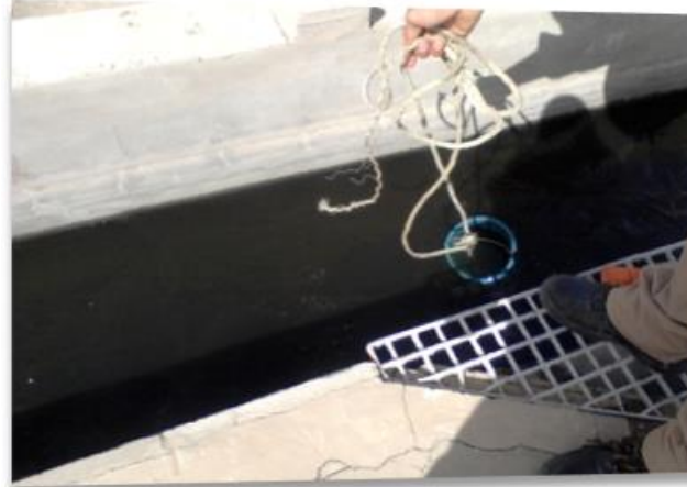
Fig-1: Sampling, sampling and analyzes