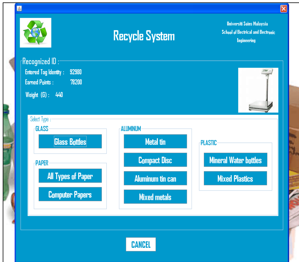
(a) Tag detection and type selection process for an authorized tag.