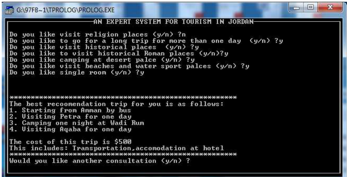
Fig.2: Consultation Session with Expert System