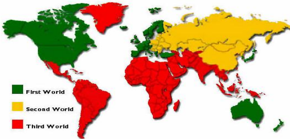
Fig:1 A map showing the countries of the world.

planning, and implementation is not only just the process of writing symbols or codes, but also follow the guidelines, and writing documents, and also write and test units. Software engineers design and develop many types of programs.