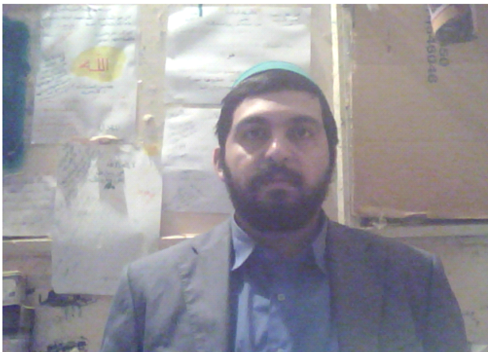
THE AUTHOR'S PICTURE