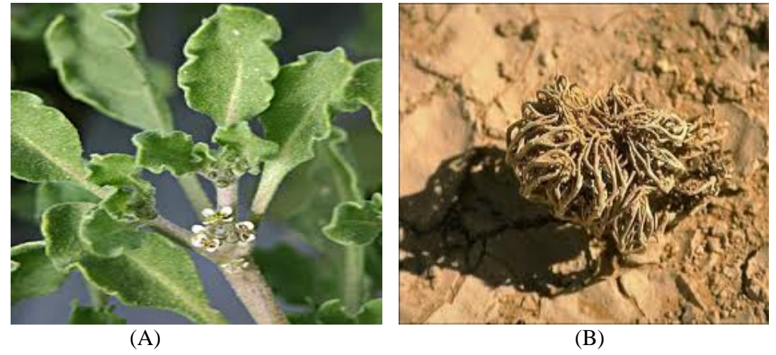
Fig. (1): green plant (A), Anastatica hierochuntica dry curled skeleton (B) (4).