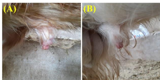
Fig. 2. Epidural analgesia in male goats. Representative images are showing relaxed preputial rings after epidural analgesia (A, B).