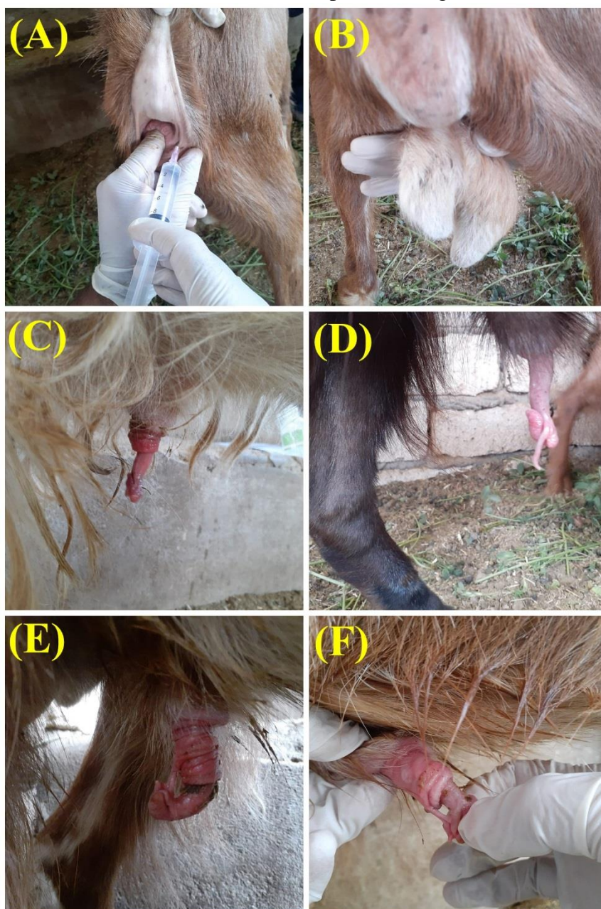
Fig. 1. Pudendal nerve block in male goats. Representative images are showing the ischiorectal fossa approach; where the gloved lubricated left index finger is inserted in the rectum to guide the needle to the slit-like sacroscliotic foramen (A), thorough andrological examination of the desensitized external genitalia (B), completely relaxed and protruded penis (C), completely relaxed penis showing the glans penis and the urethral process (D), and persistent penile frenulum as a congenital male genital system abnormality of the penis and prepuce (E, F).

prolapse of the preputial orifice (Fig. 2A, 2B). Motor blockade, incoordination and associated ataxia were observed in all animals with varying degree. Moreover, one treated male goat showed recumbency due to paralysis of the hind limbs after epidural analgesia.